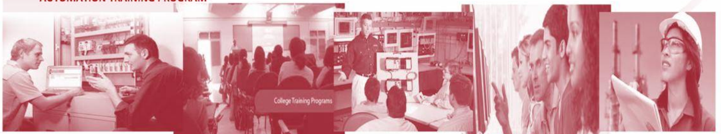
College Training Programs